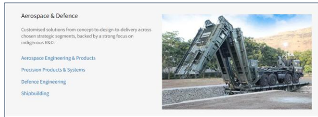
Caption: A screenshot of the Indian company's website which lists industries they are involved with including aerospace & defence.